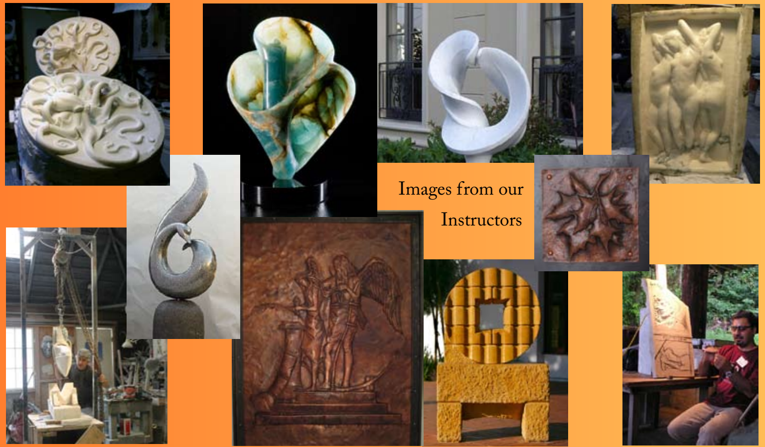
Images from our Instructors